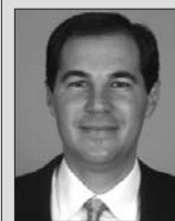
HEAD COACH SCOTT DREW SEVENTH SEASON AT BAYLOR