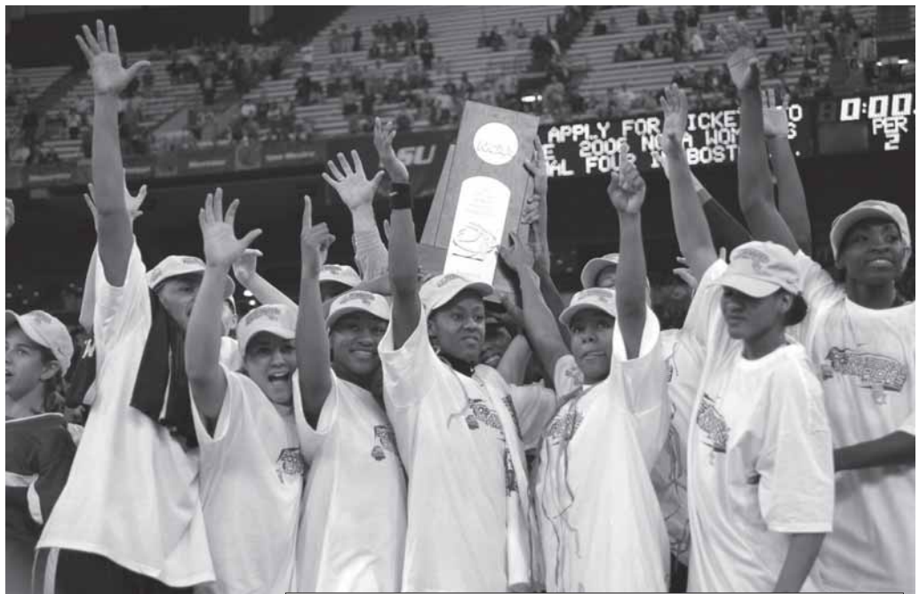
BAYLOR CAPTURED THE BIG 12'S FIRST NATIONAL CHAMPIONSHIP IN BASKETBALL LAST SEASON.