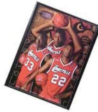
Football & Basketball Media Guide