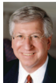
MYLES BRAND NCAA President

Most importantly, keep your educational goals among your top priorities.