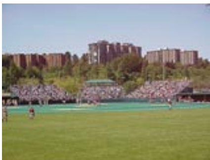
Husky Ballpark (1998) Montlake Boulevard, on campus AstroTurf infield, grass outfield 2,000 (2,132 vs. Oregon St., April 25, 1999)

Bullpen BAYSINGER CARTER CONOVER DOWLING EVERITT HAWKINS KASSER PETERSEN ROBERTSON VILLALOBOS