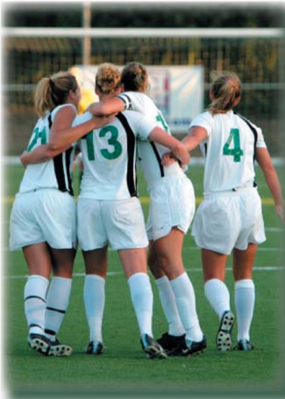
Reason to Celebrate: Dons women's soccer enjoys best season since 1997