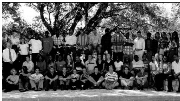
► The 2004 team earned TCU's first women's indoor conference title by capturing the Conference USA Championship.

The University Relay Titles All-Time Greats History 2006 Cross Country Review 2006 Track Review Athlete Profiles Coaching Staff This Is TCU Track General Information