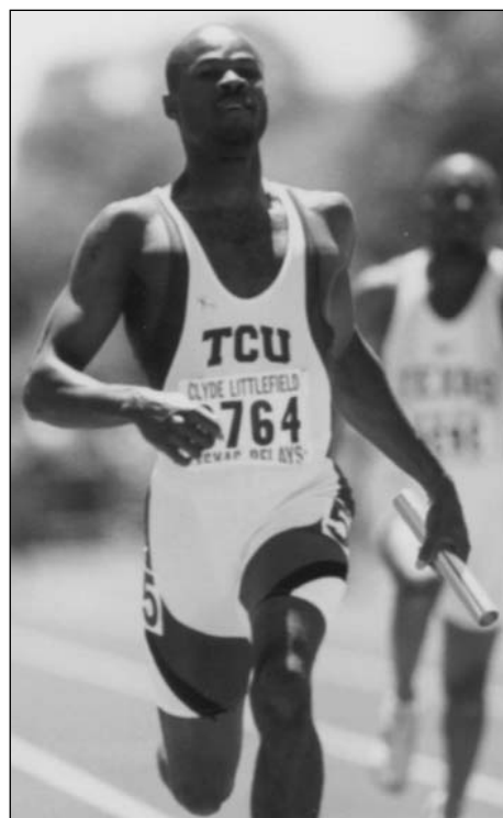
► Kim Collins won the 60 and 200 meters at the 2001 NCAA Indoor Championships.