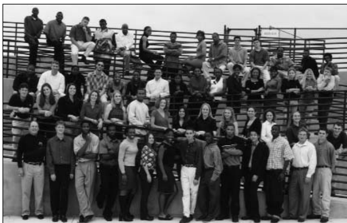
► The 2001 men's team won TCU's second consecutive WAC Indoor Championship, while the women finished fourth in the league.