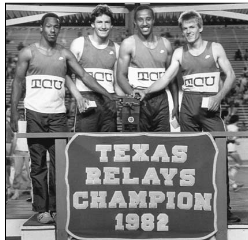
► TCU's Sprint Medley Relay team captured the gold medal at the 1982 Texas Relays.