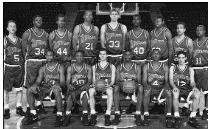
UMass advanced to the Sweet 16 in 1992 (top) and the Elite Eight in 1995 (bottom).