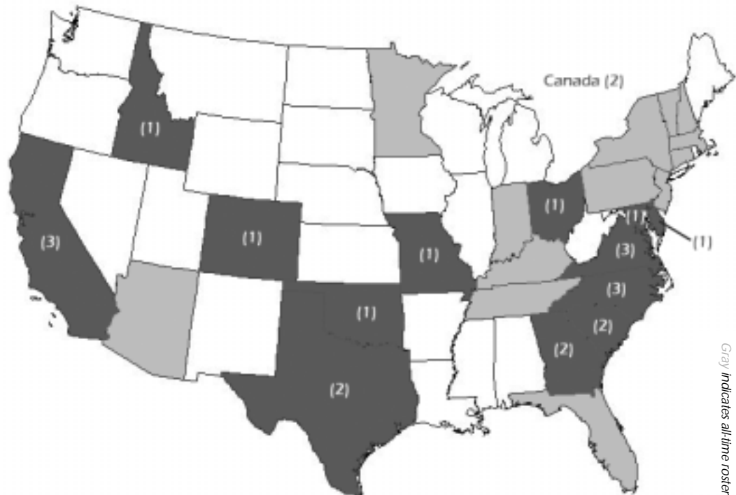
Black indicates 2003 roster Gray indicates all-time roster

Since the program started in 1994, the Deacons have been represented by 26 different states and two Canadian provinces including: California, Idaho, Arizona, Colorado, Texas, Oklahoma, Missouri, Minnesota, Indiana, Ohio, Kentucky, Tennessee, Florida, Georgia, South Carolina, North Carolina, Virginia, Maryland, Delaware, Pennsylvania, New Jersey, New York, Connecticut, Massachusetts, New Hampshire and Vermont -- plus Ontario and Nova Scotia.