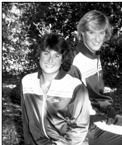
Mary T. Meagher (left), with fellow Cal Hall of Famer Conny van Bentum, is one of the all-time great women swimmers.