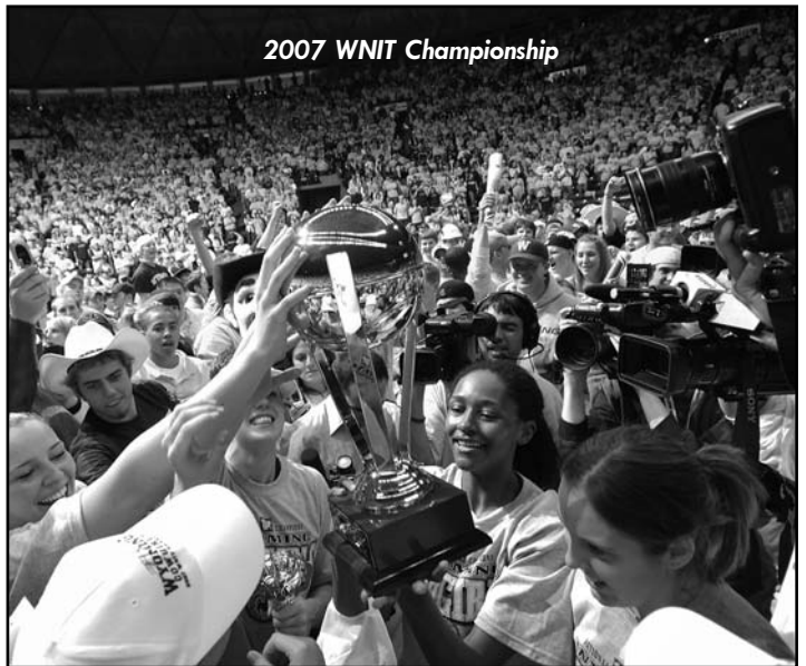
2007 WNIT Championship