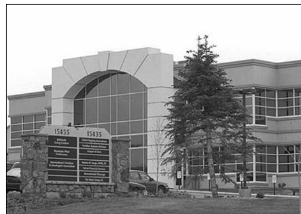
Mountain West Conference Office