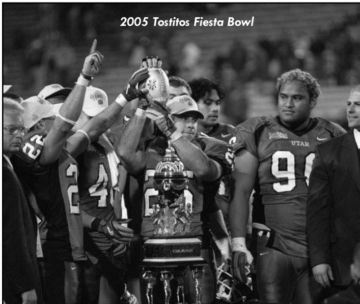
2005 Tostitos Fiesta Bowl