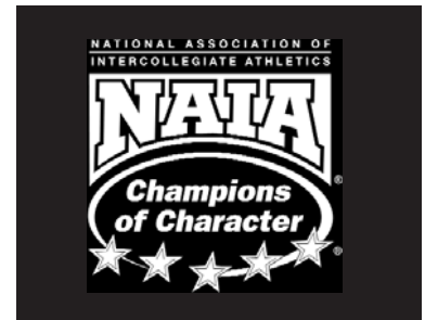
White on Dark Background