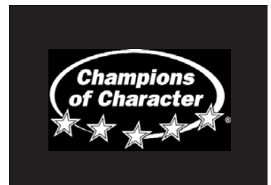
White on Dark Background